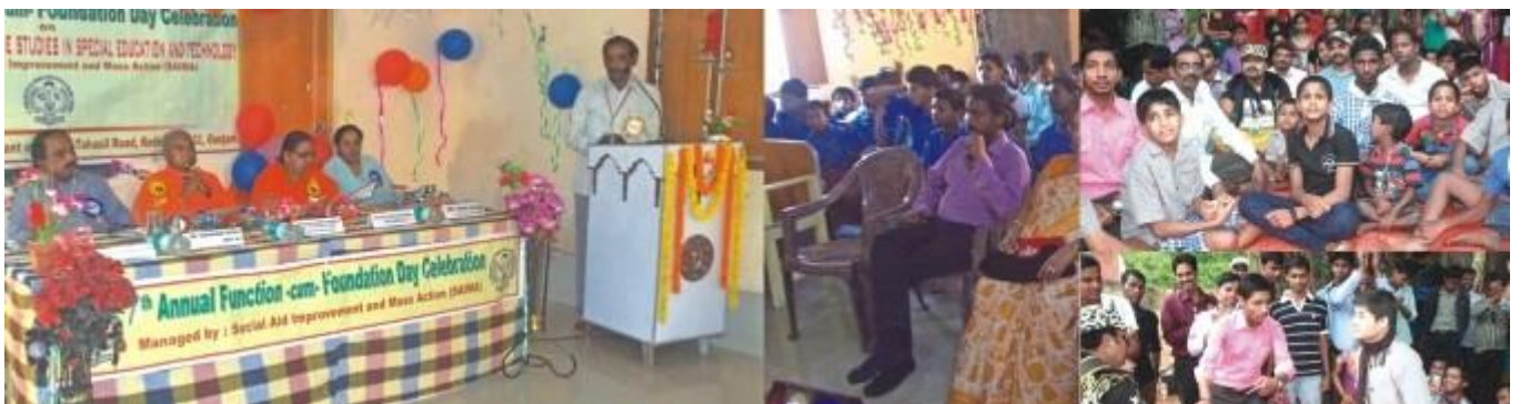
Annual Function cum Foundation Day Celebration