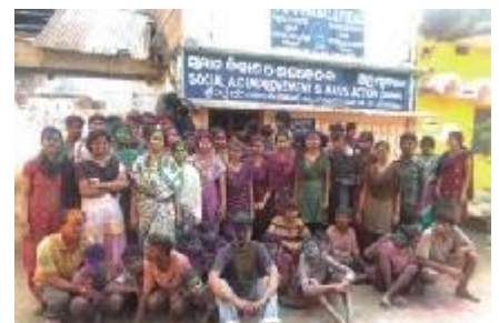
Holi re Holi