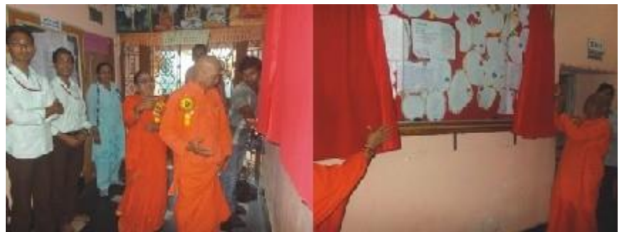
Inauguration of wall magazine