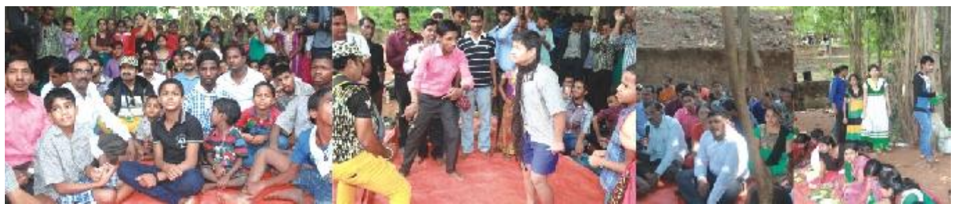
Picnic at Budhakhola