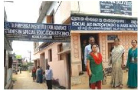
Our Special School & College