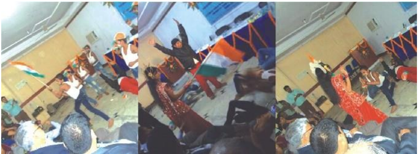
Cultural Programme by MR children