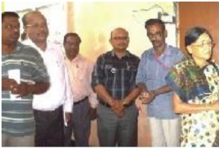
Inspection team with DSWO and ADSWO, Chhatrapur, Ganjam, Medical officer, C.H.C., Kodola and Tahasildar, Kodala with our principal