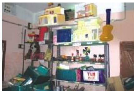
Our Resource Room