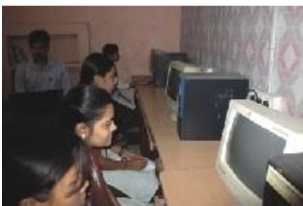
Our Computer lab