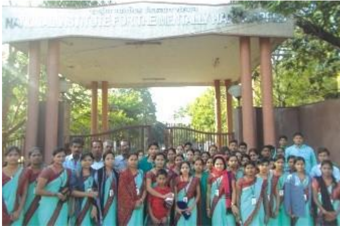
Student & Staff on Study Tour programme at NIMH,Secundrabad