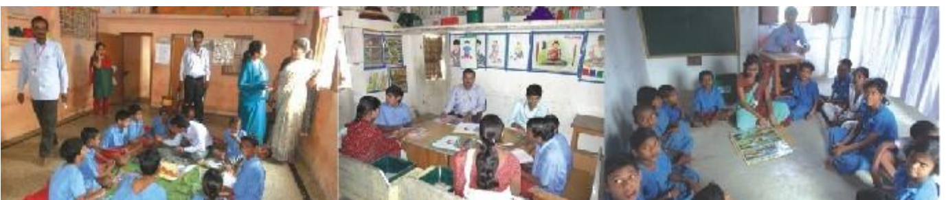
Class room interaction (spl. school)