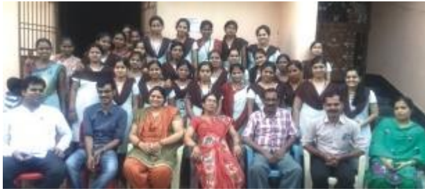
B.Ed Students 2015