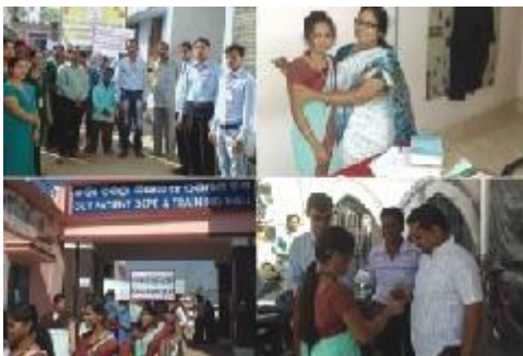
A View of World Disable day