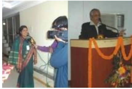
M.B.C TV interviewing on Sensitization Programme