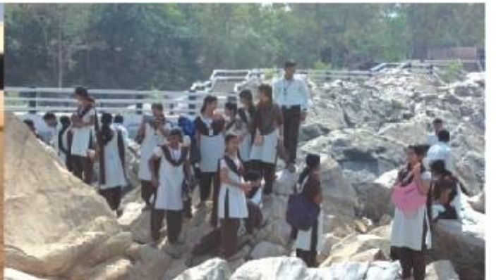
Study Tour Programme at Keonjhar