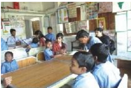
B.Ed. Students Teaching Fine Motor Skill to MR Children