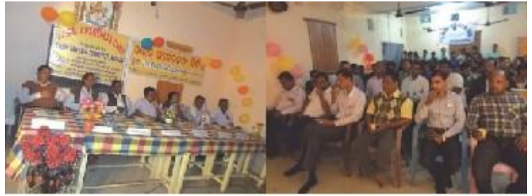
Legal Awareness Camp