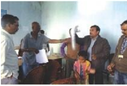
D.C.P.O Gajapati Handing over a Child to Balvikas in the presence of CWC Members of Ganjam